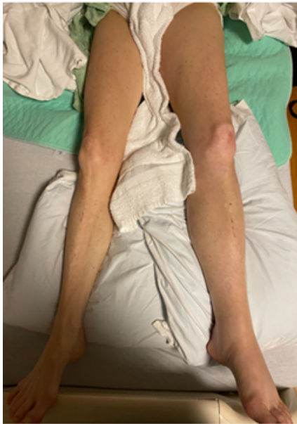
Figure 5: Left lower extremity on hospital discharge.

obstruction of arterial flow, and ultimately capillary involvement leads to venous gangrene [4].