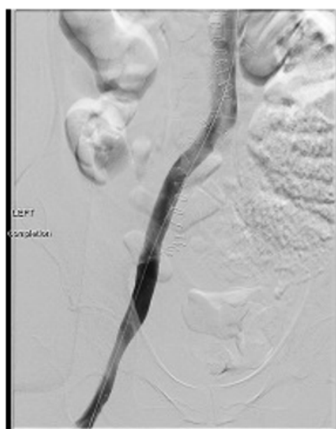
Figure 4: left common iliac vein stent.

Venogram showed diffuse thrombosis of the left femoral, common femoral, external and common iliac veins with high-grade stenosis involving the common iliac vein. Mechanical thrombectomy was repeated with the Inari Clottriever. The venogram did not show residual thrombus. Intravascular ultrasound demonstrated an 80% stenosis involving the mid to distal left CIV that was likely missed on prior imaging due to overlying thrombus. Balloon angioplasty with a 14mm Atlas balloon was performed within the common iliac vein, followed by placement of a 16 x 120mm Boston Scientific Vici stent (Marlborough, MA.). Completion venogram demonstrated adequate inflow and outflow through the left common iliac vein stent with no significant residual thrombus or stenosis (Figure 4).