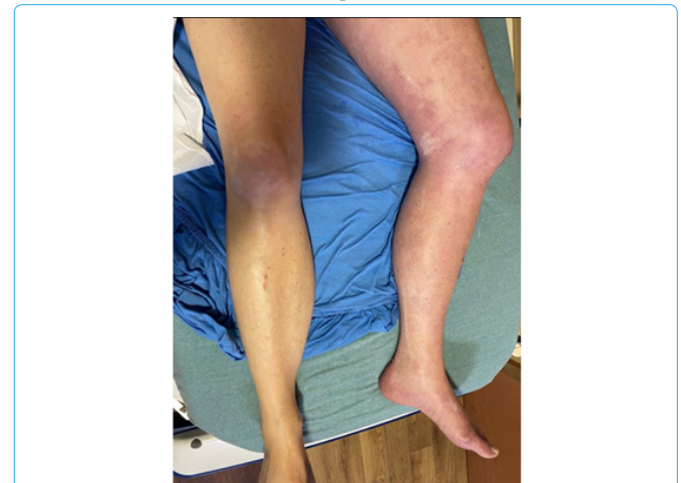
Figure 1: Left lower extremity swelling and skin color changes significant for phlegmasia cerulean dolens.

nacava (IVC) and left CIV with evidence of thrombus in the left EIV, Internal iliac vein, and CIV. Ankle-brachial indices were not obtained. She was started on intravenous heparin.